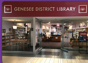
Genesee Valley Center