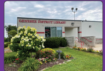
William F. Delaney Headquarters