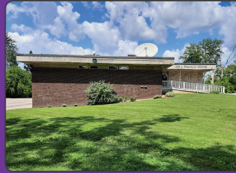
Beecher-Vera B. Rison