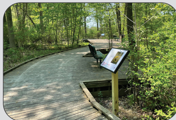
Eagles Wooden Park, Linden

In partnership with Grand Blanc Township, the City of Linden, the Grand Blanc High School Trades II class, and the Mideastern Michigan Library Cooperative, Genesee District Library opened two Story Book Trails. One is in Eagles Wooden Park in Linden, and the other is in Rust Park in Grand Blanc.